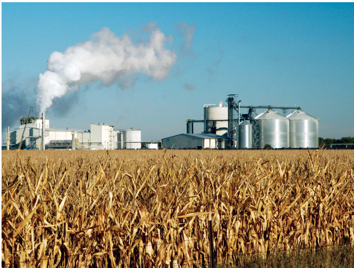
Large-scale production of biofuels will lead to an increase in food scarcity and rising prices

A wealth of studies from international organisations - the FAO, the World Bank, the OECD and the Royal Society amongst others - have warned that exploiting the world's theoretical bioenergy potential will have dramatic negative social and ecological impacts, such as further pressure on small farmers and communities that depend on the land, upward pressure on food prices and land rights conflicts. It could also trigger indirect land use change such as deforestation in South East Asia and Latin America. In the worst cases this would result in net increases in greenhouse gas emissions.