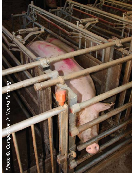
Sow stalls in an intensive pig farm, Denmark