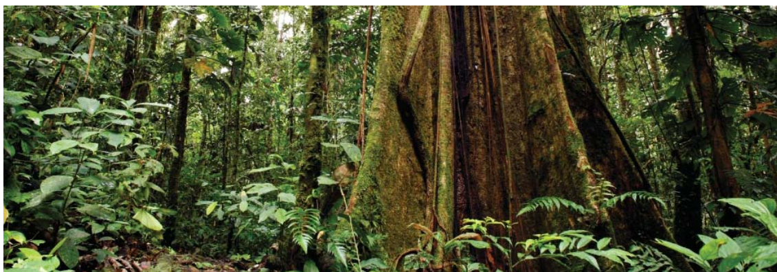
Forests are critical for the Earth's survival