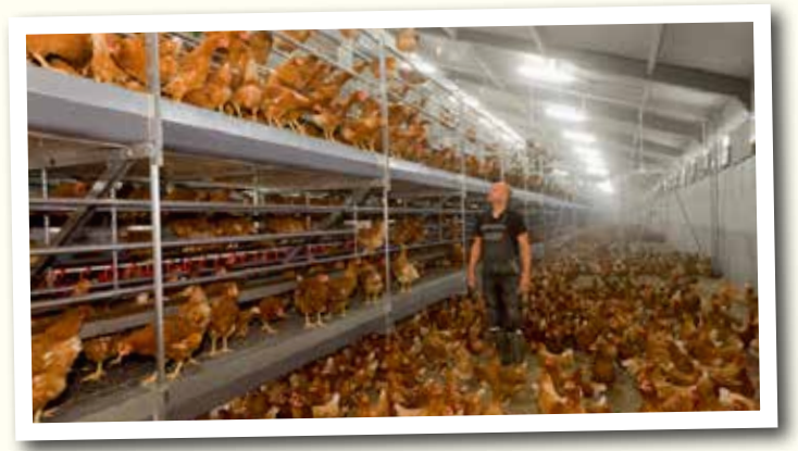
Vencomatic Red-L system in use.

Cage-free multi-tier or aviary systems were developed in Europe, about two decades ago, to enable producers to maximise the use of space in a cage-free system, without compromising the minimum welfare needs of the hens.