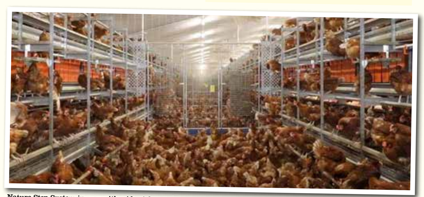
Nature Step System in use, with wide aisles.