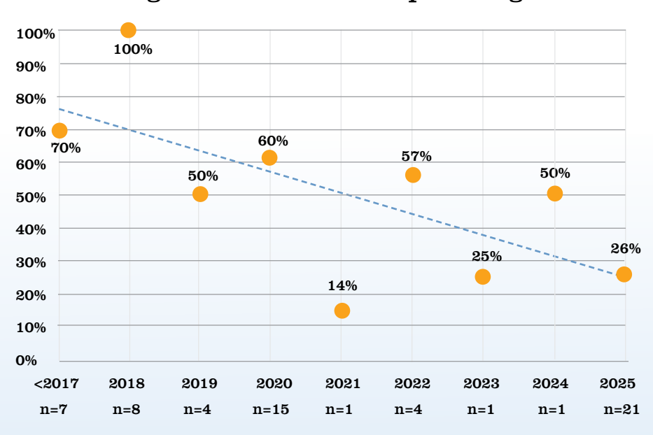
This graph shows the proportion of commitments that have been reported against, by end-date.